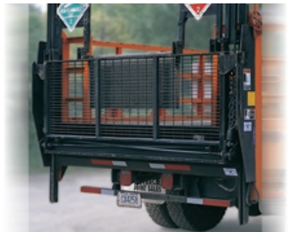
Steel bar grating - optional

Call 800-289-1335 in the U.S. 416-421-7987 in Canada