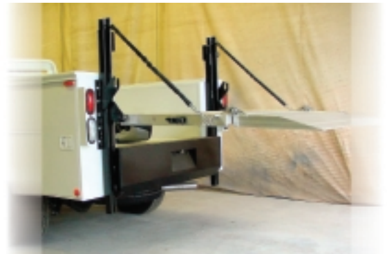
Above floor lift - optional

Call 800-289-1335 in the U.S. 416-421-7987 in Canada