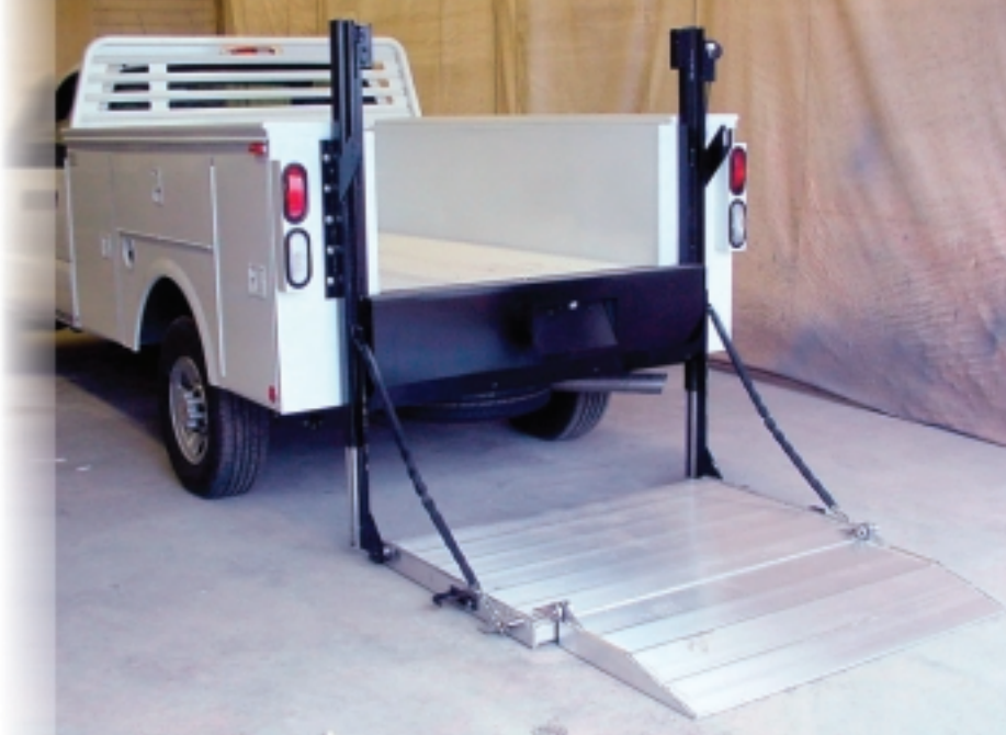
Aluminum platform - optional